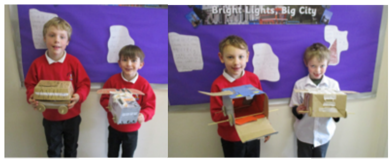
5: Children from Robins with their new and improved London Taxis!