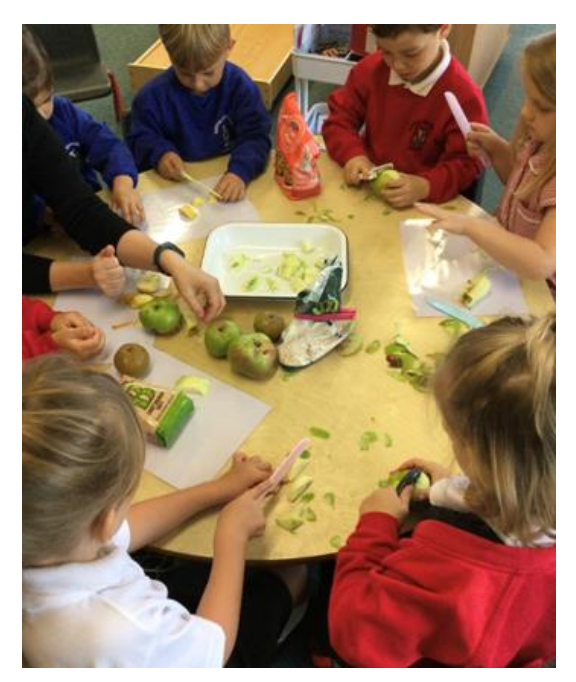
2 Early Years Children made Apple and Blackberry Crumble