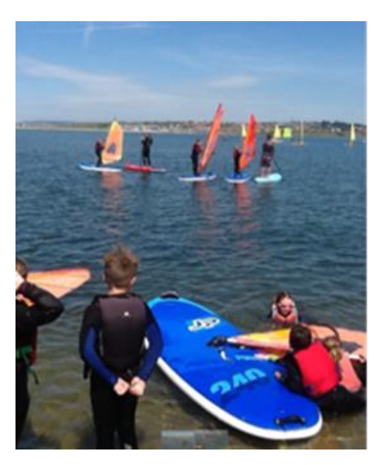
1: Year 4/5/6 enjoyed a trip to Portland harbour for Windsurfing and Paddle boarding!