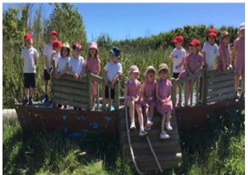
3: The Friends of school paid for Wagtails to go to Vurland's farm for a trip - they had a wonderful time!

2: Robin class loved their trip to the beach as part of their 'Beachcomber' topic