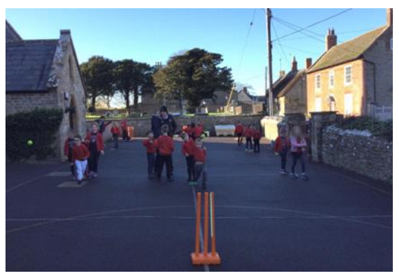
2: Our KS1 class, Robins, are really enjoying their weekly cricket coaching sessions with Chance to Shine.

1: Wagtails have had a visit from some fairies who want to tell them all about some fairy stories!