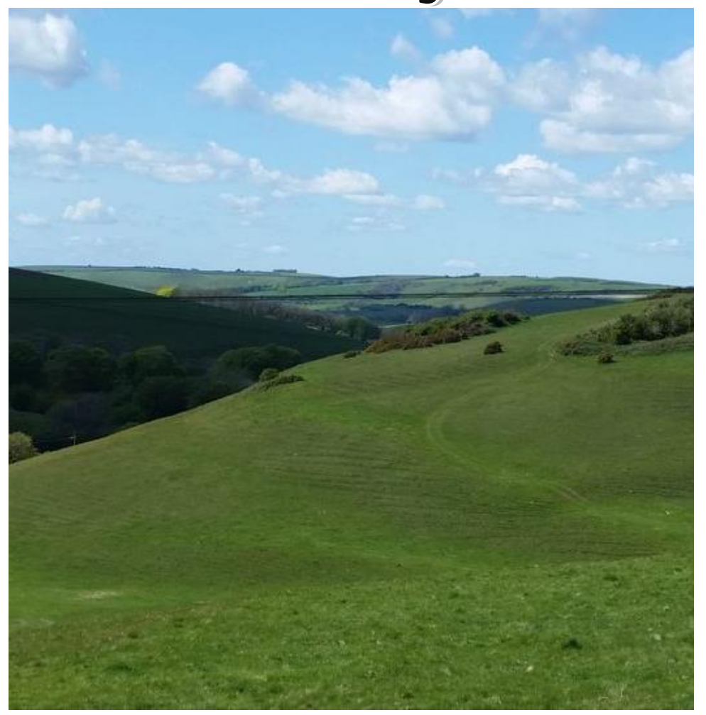
The Magazine of the Bride Valley Churches June 2021