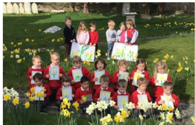
Easter Early Years