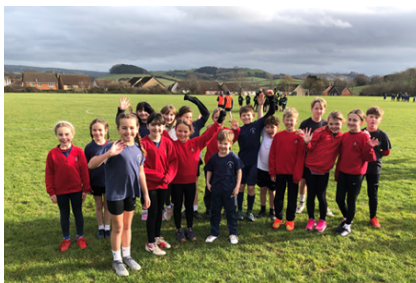
Our KS2 Cross-Country Squad at a recent competition

After half term, our KS2 children are looking forward to getting back to either swimming lessons (Kingfishers) or PE in the sports hall (Owls). There are also more sporting events to look forward to such as Cross-Country relays and a dance festival! In Collective Worship, we will be focusing on our school value of 'Love' and continuing our Rights Respecting Schools work both in classes and with the school council. We look forward to our Easter Service at the end of term and hope to see lots of families there.