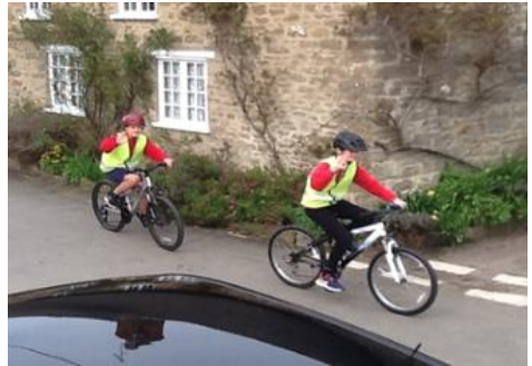
4: Year 6 pupils enjoying bikeability