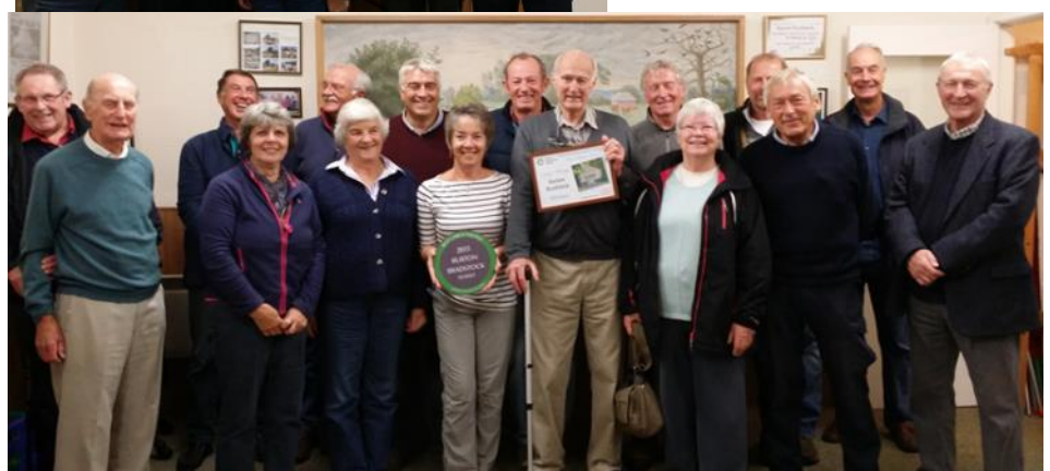
The Burton Bradstock Volunteers

The Parish Council would like to thank everyone involved in keeping the village tidy planting, painting and generally maintaining this beautiful village.