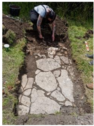
Part of the flagstone floor uncovered in one of the test pits

The archaeological event was a great success both for those participating and those visiting. Over the weekend we opened up nine test pits and found plenty of pottery and various other items of archaeological interest. A big surprise find was a flagstone floor of a cottage and with it an early window frame and oven door. We also found the original cobbles of Friday Lane when it was the main street through Long Bredy and in another test pit we found the street again with foundations of what is believed to be 'The Bottle' pub. The geophysical surveys have also come up with