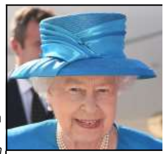
63 Years, 12 days @13/6/15