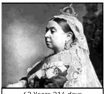
63 Years 216 days