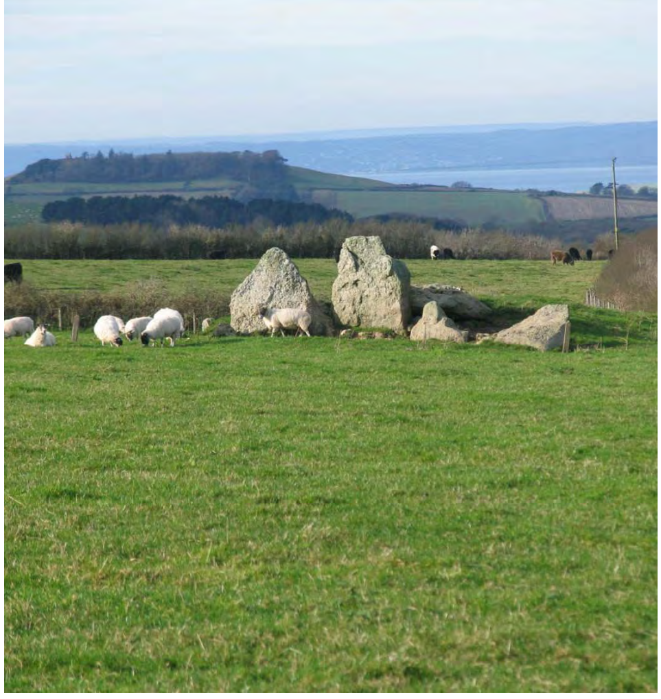
The Magazine of the Bride Valley Churches April 2015