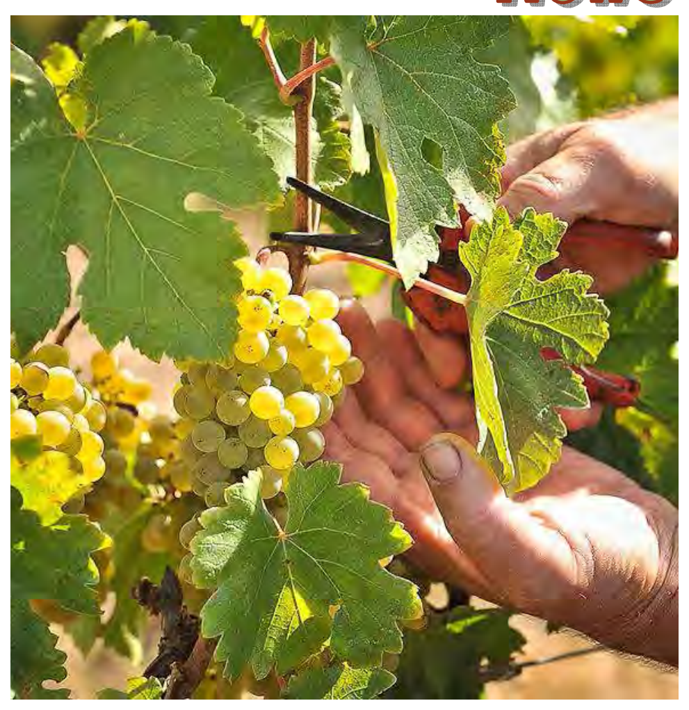
The Magazine of the Bride Valley Churches October 2014