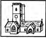
THE RECTORY, BURTON BRADSTOCK