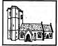
THE RECTORY, LITTON CHENEY

We had a friend of a friend staying who had her handbag stolen from a car. Why she had left the handbag in the car is anybody's guess, especially as it was stuffed with enough cash to keep us in food for a month - and we live well at the Rectory. The next question is why she had spent £500.00 on the bag itself. The reason given was that the same bag cost twice as much in New York, which makes the E.U. all of a sudden and surprisingly a bargain basement economy.