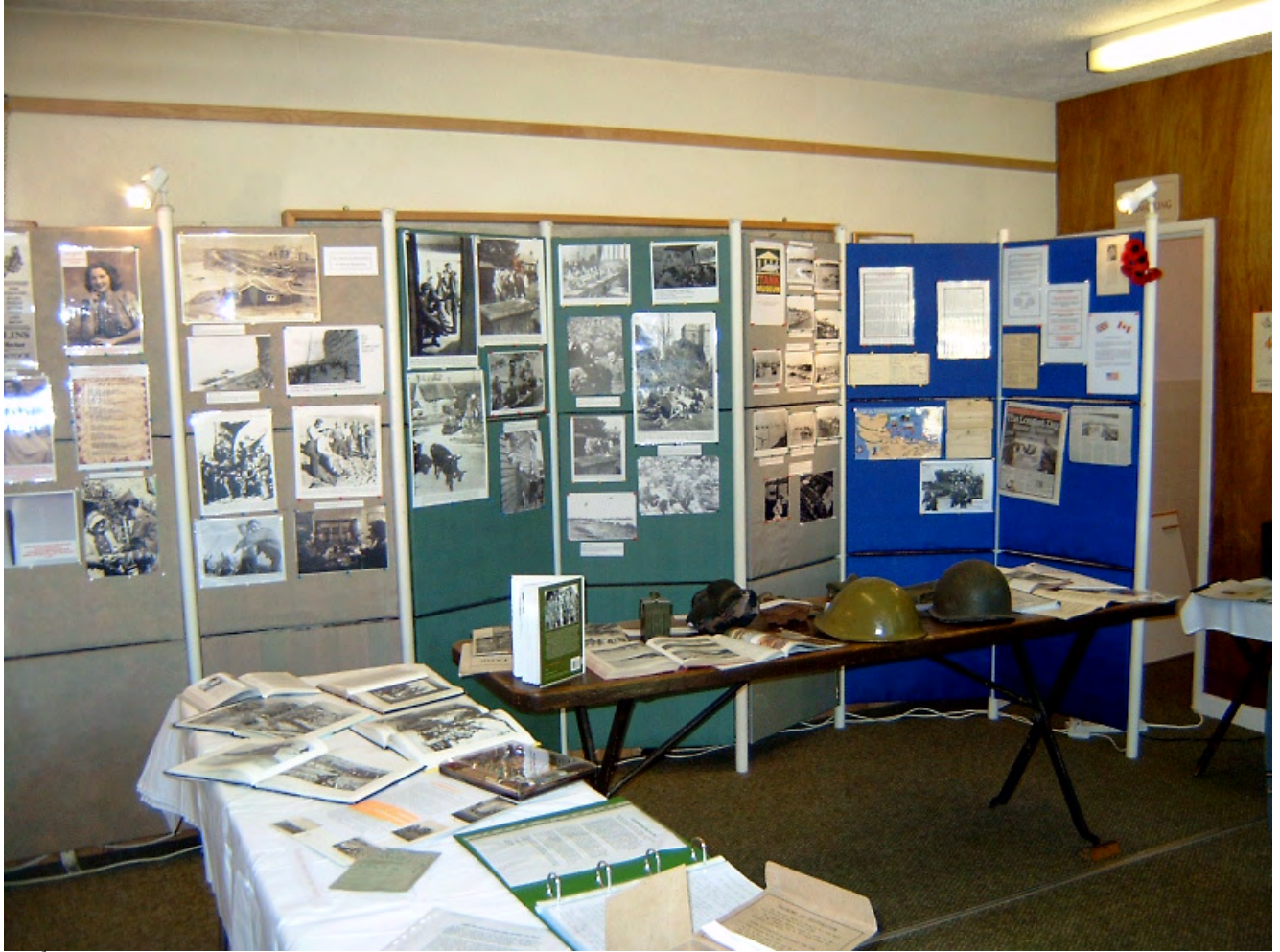
60 th Anniversary of VE Day Exhibition held in the Reading Room 2005