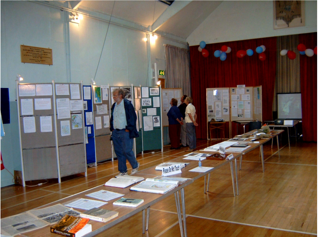
Forgotten Army exhibition August 2005- Burton Bradstock Village Hall.