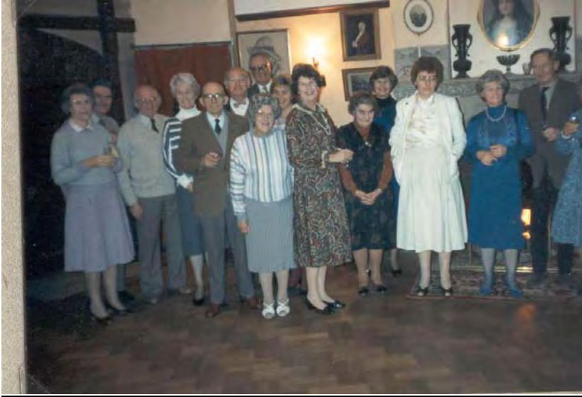
Poppy Collector's party 1988