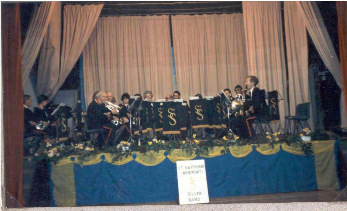
St. Swithun's Band Concert in aid of The Poppy Appeal fund 1988