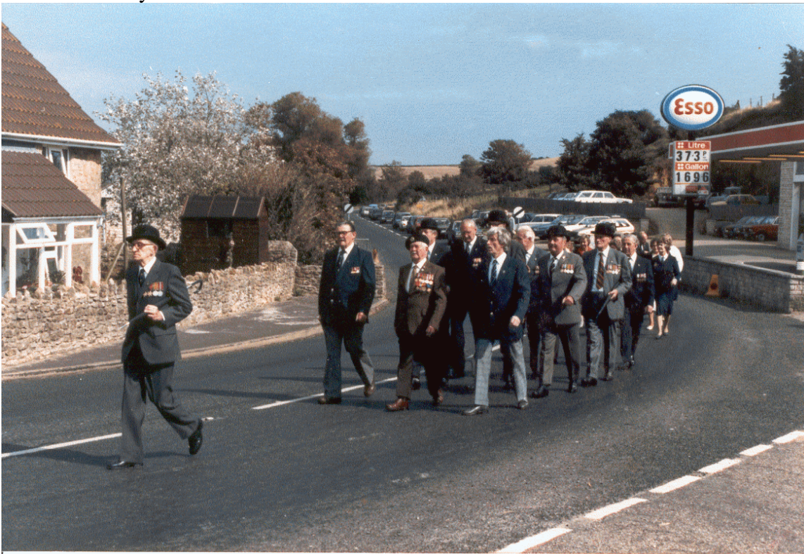
Bride Valley Branch Golden Jubilee Parade 1986

The Jubilee parade went well despite no County Standard. A letter had been received from the County Chairman for the absence of the Standard.